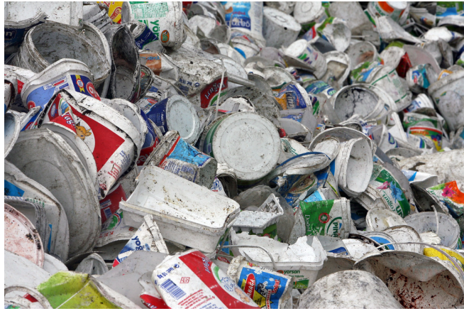
When it comes to waste, we need a paradigm shift.

capture. For example, waste-to-energy facilities create value from materials that would otherwise be landfilled.