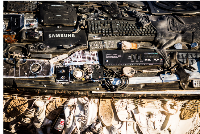
Circular economy reforms can help address e-waste.

The Basel Convention is an international treaty designed to reduce the movement of hazardous waste between nations, particularly from developed to less developed countries, due to concerns regarding the public health consequences of dumping. Countries' adoption of laws implementing the Basel Convention serves as a critical check against problematic cross-border flows of waste. However, the convention can impede remanufacturing of post-use products and recovering secondary materials from manufacturing and used products. So, while electric vehicle lithium batteries can be repurposed, some countries treat them as hazardous waste, which has the effect of hindering