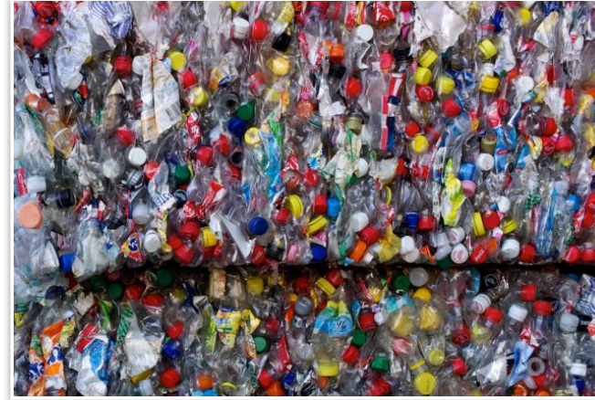
Recycling's good. Reducing's better.